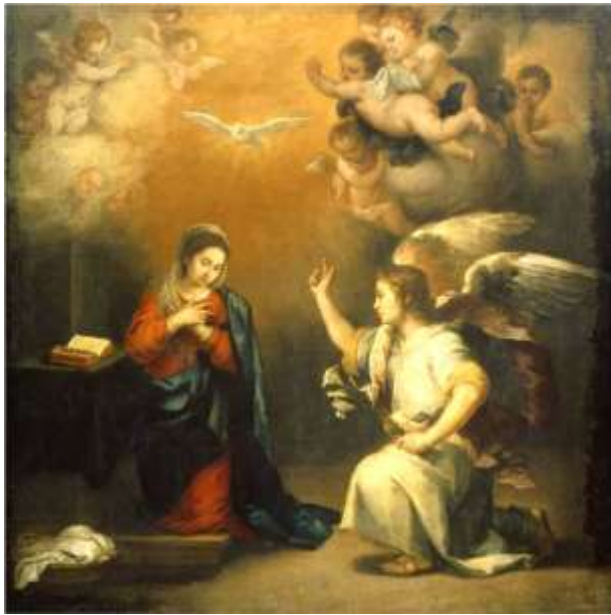
(Artist: Bartolome Esteban Murillo Date: 1680)

Forget not the materialisation of god's will through your form. Forget not the potential of expressing divinity. Forget not the potential of experiencing eternity. Forget not your descent from the causal and astral realms. Forget not your purpose in the overall scheme of the lord. Forget not your role in the overall cosmic drama directed by the lord. Forget not the divine grace pouring down from the heavens! O mortal!