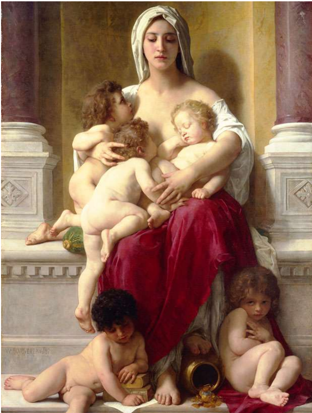
(Artist: William-Adolphe Bouguereau Date: 1825-1905)