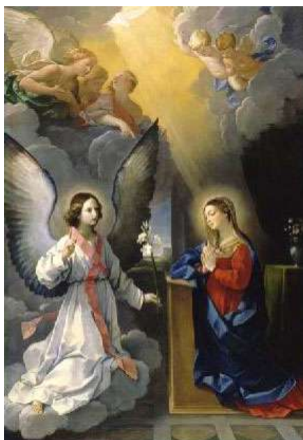
(Artist: Guido Reni Date:

Forget not the eclipsing of your spirit in cosmic delusion.