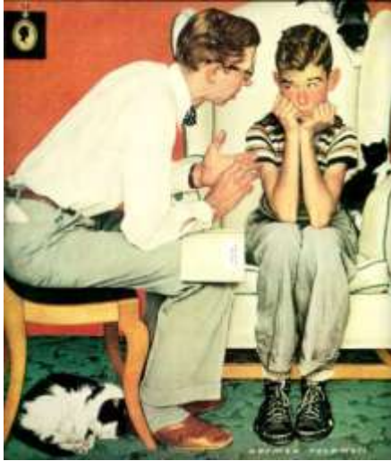
(Artist: Norman Rockwell Date: 1894-1978)

Listen to the silent preacher. Discard your orthodoxy without hesitation. Beckon the lord of learning. Join the heavenly congregation. Join the divine banquet. Why don't you ask the questions buried in your heart! O mortal!