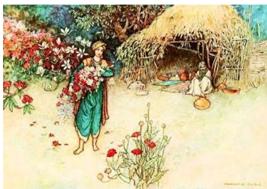
(Artist: Warwick Goble Date: 1862-1943)

Let man ignite his inner sacrificial fire. Let man burn his personal desires in the fire of renunciation. Let man embrace meditation kindled wisdom. Let man unite fire of his concentration with the flame of god. Let man merge his souls spark with the cosmic light. Let man be one united to the lord. Let man's life be designed by the lord.