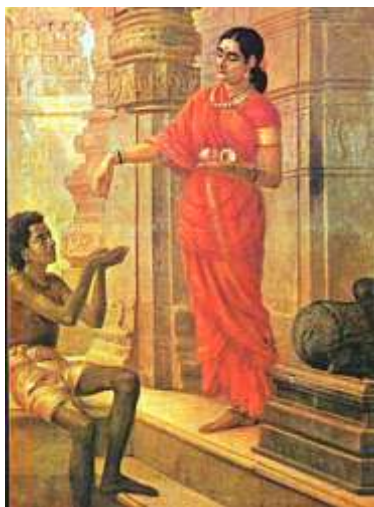
(Artist: Raja Ravi Varma Date: 1848-1906)

Let man express his divine resolute intent. Let man acquire responsibilities for his much larger family. Let man regain his ageless wisdom. Let man aid in the spiritual awakening of mortal hearts. Let man make his heart a hermitage of the lord. Let man strive for inner desirelessness and nonattachment. Let man hear the echoes of ancient wisdom in the cosmos.